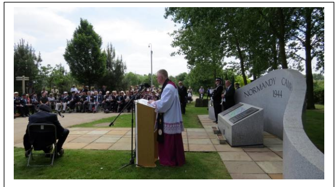
Veterans and supporters gather at the National Memorial Arboretum