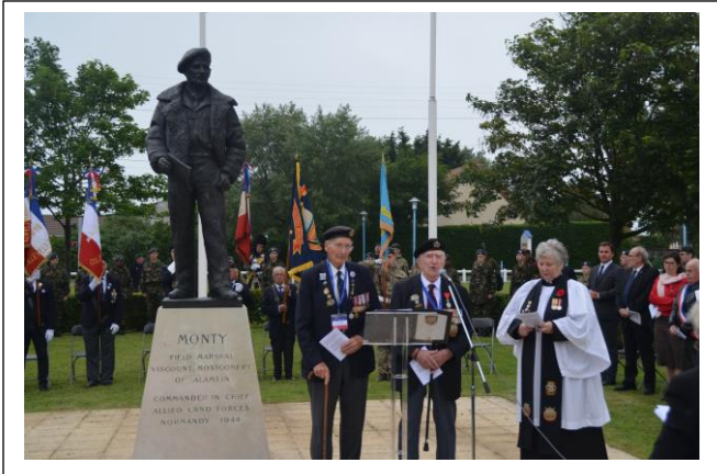
Service at Colleville Montgomery

As in past years the service concluded with a march past followed by a Vin d'Honneur on the sea front, hosted by the Community of Colleville Montgomery.